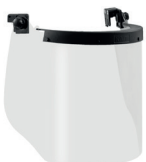
WV100014 ARC VISOR CLASS 1