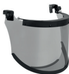
WV100034 ARC VISOR CLASS 2 ERGO