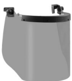
WVI00016 ARC VISOR ATPV10