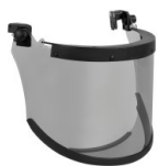
WVI00035 ARC VISOR ATPV27 ERGO