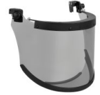
WV00035 ARC VISOR ATPV27 ERGO

Test: ASTM F2178-12 | ATPV 10.0 cal/cm 2