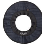
WAC00073-514 FR SUN SHIELD | BLUE NIGHT

Test: ASTM F2178-12 | ATPV 27.0 cal/cm 2