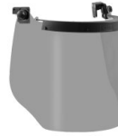
WV00016 ARC VISOR ATPV10