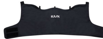
WAC00034-514 NECK PROTECTOR FR | BLUE NIGHT

Test: ASTM F1959-05 | IEC 61482/1 ATPV 22.2 cal/cm 2