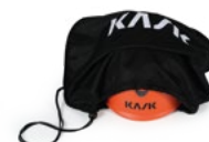
UAC00002 HELMET BAG