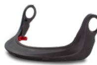
WAC00010 VISOR CARRIER