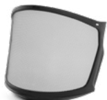
WV10009/10 ZEN MESH VISOR