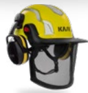
WHE00026.221 YELLOW FLUO