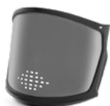
WV100012 ZEN FULL FACE