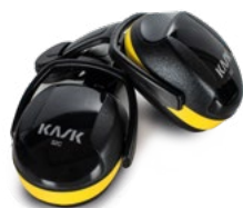
YELLOW - WHP00001.202

The yellow SC2 earmuffs are suitable for environments with a medium to high level of noise (dB). The best choice in high frequency noise situations. Suitable for a wide variety of uses such as: building and construction, forestry use, industrial areas, production areas, agriculture, ecc.