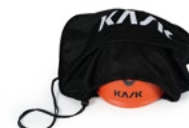
UAC00002 HELMET BAG